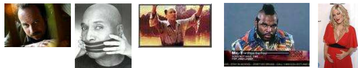
PAUL GIAMATTI, PAUL MOONEY, ROBERT DUVALL MR. T, TORI SPELLING