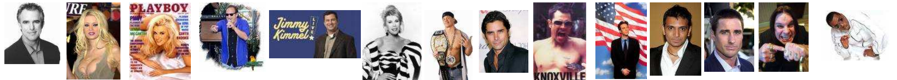
JAY THOMAS, JENNA JAMESON, JENNY MCCARTHY, JIM BELUSHI, JIMMY KIMMEL, JOAN RIVERS, JOHN CENA, JOHN STAMOS, JOHNNY KNOXVILLE, JON STEWART, M. KNIGHT SHYAMALAN, LUKE WILSON, OZZY, P DIDDY